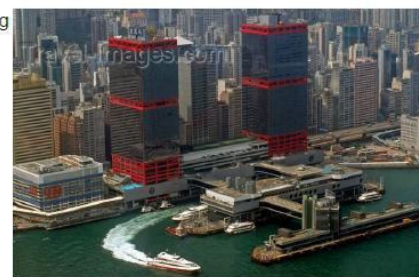
Very fast, no brakes!!!