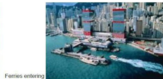
Ferries entering and exiting